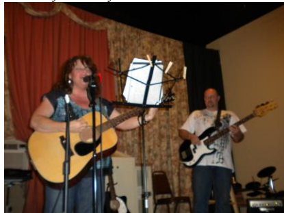
Joyful Spirit at Missy's in September