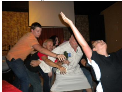
God holds them back from her