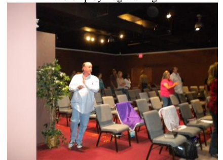
Worship is free worship at House of Refuge, a most unique concept