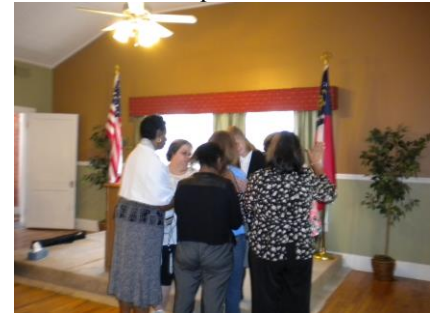
Women at the altar call

"The third side of God is the strength side. The weak say, 'I am strong.' His strength makes us mighty warriors. God can and will do it. He spoke all things into being. His strength makes us more than conquerors."