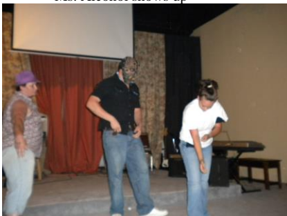
Satan gets her to cut herself