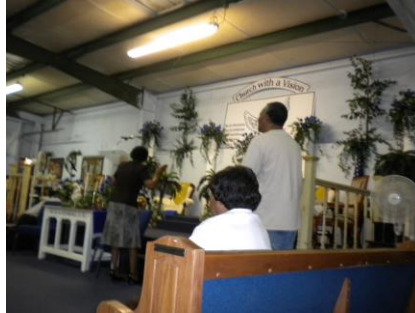
Praise and worship at MOG

ways acknowledge him, and he shall direct thy paths."