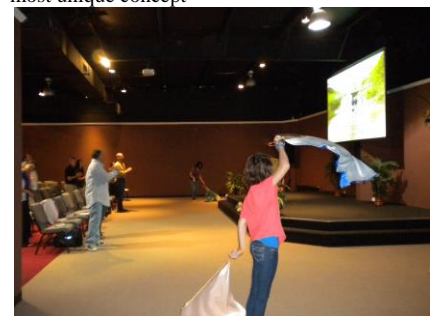
The unique worship at House of Refuge

After the offering, the worship began. There was dancing, hand shaking, people hugging each other, upbeat music, flag waving, running, kneeling. People are free to worship God the way they worship him – very refreshing.