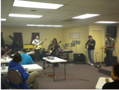
Centro de Adoracion Renacer

Adoracion Renacer began playing, the whole atmosphere changed. They began with a little taste of Spanish. Their second song, Celebrate Jesus started some people dancing. The Spanish/English songs brought this reporter to the feeling of the pure heart of worship.