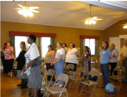
Women in deep worship at the September meeting