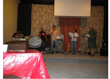
The LH Praise Team