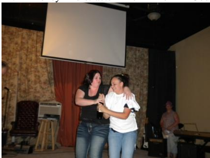
Ms. Alcohol shows up