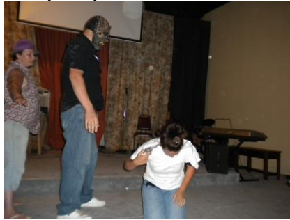
Satan has her ready to shoot herself