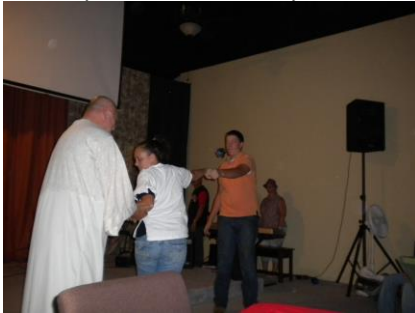
The boyfriend comes to take her from God