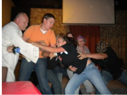
She makes the decision to try to get back with God but the things of the world hold her back