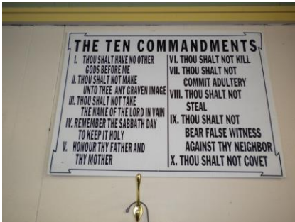
A display in the thrift store