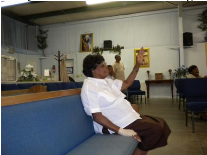
The barefoot preacher herself at MOG

A visit to Move of God is a Friday night well spent. More people need to know that there is a church service on Friday night.