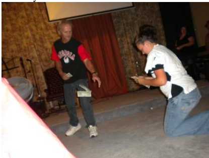
Mr. Money distracts her from God