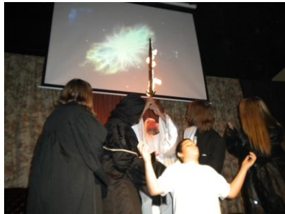
The angel of the Lord enters with flaming sword to destroy the demons