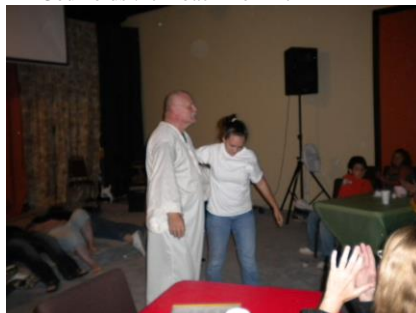
God is reunited with his child