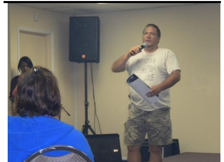
The “angel of the Lord” testifying

Christian Owned and Operated Working as for the Lord