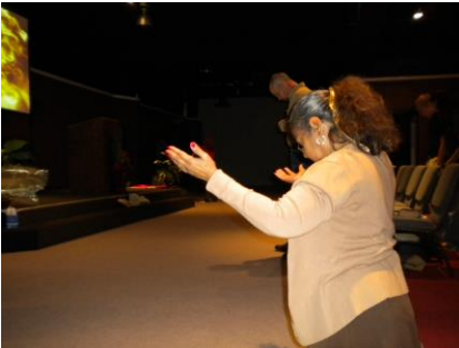
Lady worshipping on her knees

"Sometimes we make demands of him instead of requests. Jairus first worshipped him and then made his request. Neither did Jairus become jealous of the blessing received by the woman with the issue of blood. We reap what we sow."