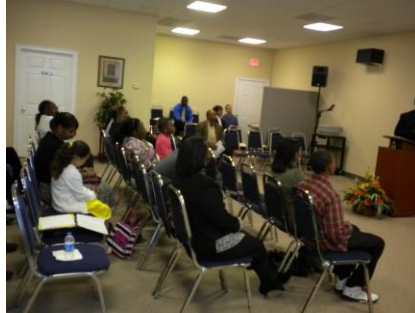
People in the Sunday worship service at Hope Fellowship

until it becomes part of your thinking, you will become strong in it. The enemy doesn’t want you to be strong in these things. James tells us to be doers of the word and not hearers only.