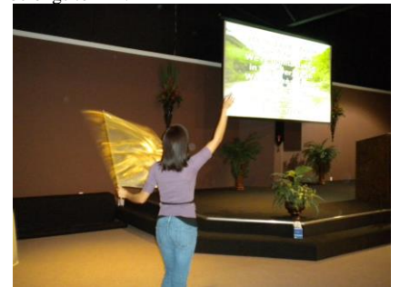
Worship by flag waving