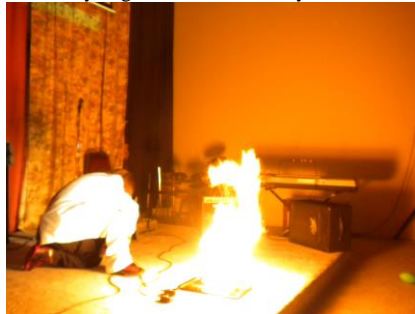
The beginning of the drama by the Emmanuel players