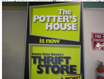
The Atlanta Mission Thrift store in winder was formerly the Atlanta Union Mission's Potter's House, named for the recovery center in Jefferson. (Cont. on pg 4)

The Atlanta Mission Thrift Store and More in Winder began in the 1920s as a soup kitchen. It became various shelters and recovery programs over the years. Although it has always