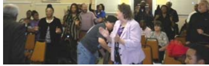
The little church building at Christ Outreach was packed out with people in praise & worship