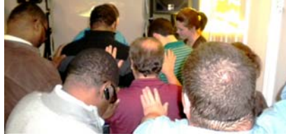
Prayer over people