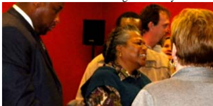
Healing from infirmity