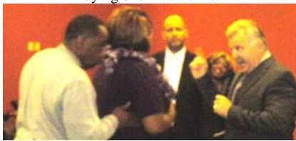
Praying over a lady's abdomen