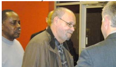
Prayer over Rev. Moon