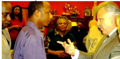
God says you have sin in your life