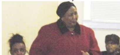
Ain't no party like a Holy Ghost party