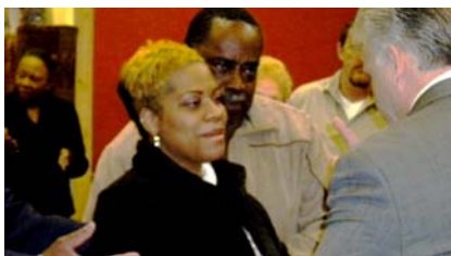
Prayer over many people