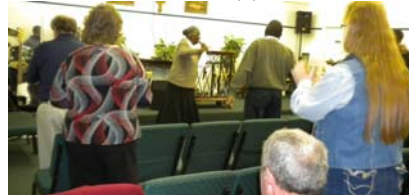
People in Worship