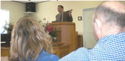
Preaching at Friendship

"Rev 2:5 – 'Repent!' My prayer for those of us at friendship Church is that we be fully repentant. How can we bring others in if we are not walking in his ways?"