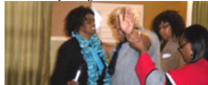
Prayer over people