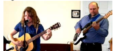
Praise & worship at Friendship Church

In John 15:19-20 we see that it is because we have Jesus in us that the world hates us. We are not greater than our master.