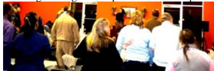
People in worship