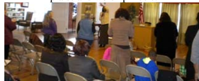
Women in worship