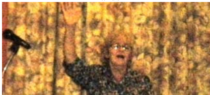
First Lady Wanda Stevens MC