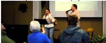
Praise & worship