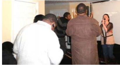
People in worship

In John20:19-20 we see that the disciples were gathered together in hiding, fearing the Jews. They were scared to death and they were in unity. Jesus stood in the middle of them and said, 'Peace be with you.' When you have unity in the house, there is peace. We need to get there.