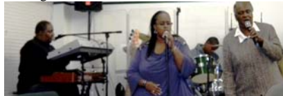
New Harvest Praise Team