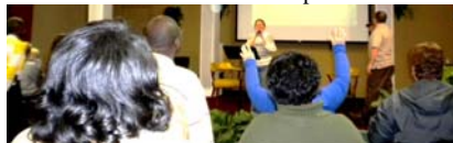
God’s people in worship