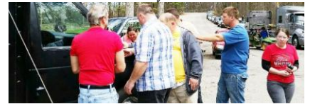
Commissioning the Love Truck