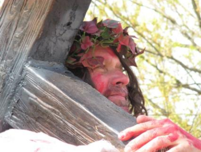
To die that we might live