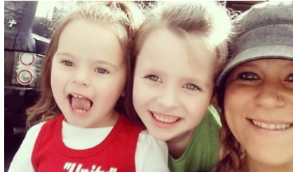
Baby Unity Members