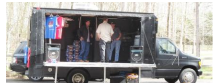
The Love Truck