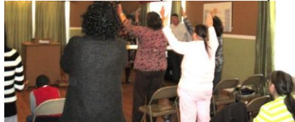
Women in worship