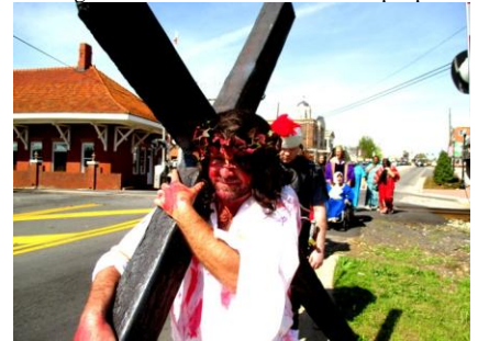
Yeshua N'zari carries the cross for us.