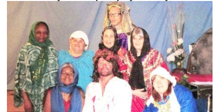
Some of the people before the walk

There were people from Love of God Mission,