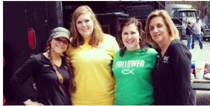
The volunteers from American Machinery