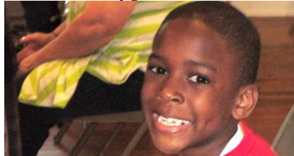
Irresistible photo opportunity