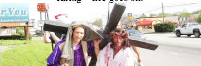
Simon of Cyrene helps an exhausted Jesus carry the cross.