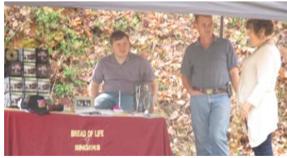
Bread of Life Singers product booth