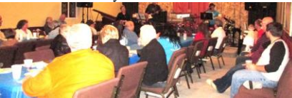
Enjoying Larr Bear's