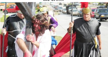
Cut to ribbons by the scourging, he carries the cross to Golgotha.