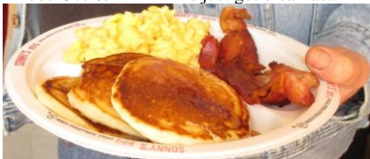
Pancakes, eggs, and bacon for breakfast