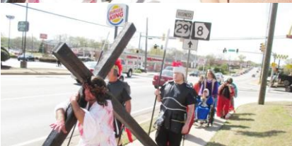
Christ Carries the Cross through a world not caring – life goes on.