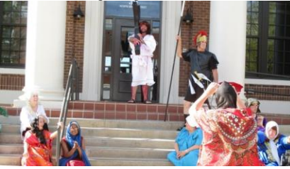
On top of symbolic Golgotha (the courthouse)