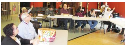
Praise and worship at the table