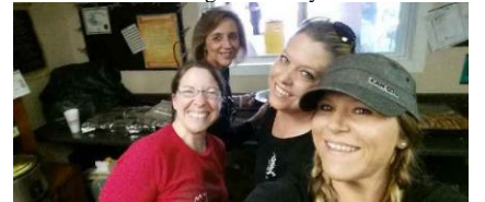
Cooks for the people