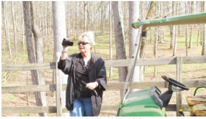
Rock making the video