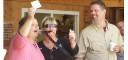
Giving stuff away