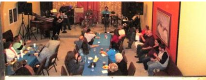
The coffee house from above