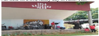
Lula Train Depot (see pg 7)

The 5th annual Rise Up in the City Shoe Drive was held on a hot, sunny day in June. This