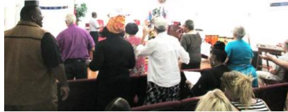
The people in worship