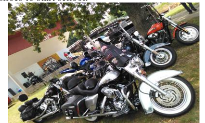
Bikers for Jesus

event was dedicated to bringing awareness of a need in local communities, and collecting new and/or gently used shoes to bless kids in need of shoes to start school.