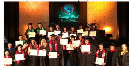
The graduates of North Georgia Revival School of (see pg 11)

On Friday 17 June at 1900 (7pm) the Students