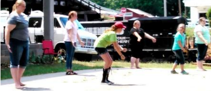
The Alley Church Youth Dance Team