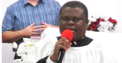
Pastor Joseph: “The way our nation is headed, is dangerous ground. In Washington DC, only 18% believe the Bible, yet 86% claim they are Christians.

“In 1781, two years before the end of the revolution, Congress approved the money to have Bibles placed in all the schools. In 1783, America became a free nation and was forever tied to this book. The more it was taught and received, the greater our nation became. Now the more it is ridiculed or ignored, the more trouble is generated for this nation. In 1982, even a secular magazine could see it, but I would not pay 2 cents for a Newsweek today.”