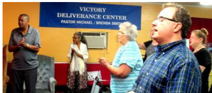
The people in worship