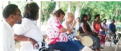
Coming together under the pavilion

On Saturday June 11, 2016, there was a community gathering in Matthews Park in