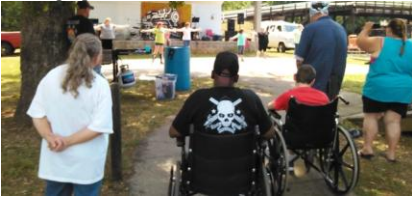
On the way to see the dance group

This was followed by a worship presentation of The Alley Church's youth dance team: Shackles by Mary Mary, Rise Up by Lauren James, and Now Behold the Lamb by Kirk Franklin were choreographed.